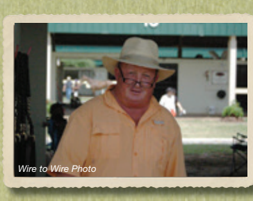
Eddie Woods Eddie Woods Training Center