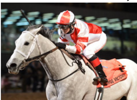
Joyful Victory takes the $400,000 Houston Ladies Classic

The 2013 American Quarter Horse Meet will begin on Thursday, March 28 and will once again be highlighted by the Grade II $100,000+ Bank of America Challenge Championships and the Grade II $100,000+ Sam Houston Futurity. New to the Quarter Horse meet this year will be a free concert series where admission to all post-race concerts will be free for all guests arriving before 8:00 p.m. who purchase $6 live racing admission. The concerts will be $20 for guests arriving after 8:00 p.m.